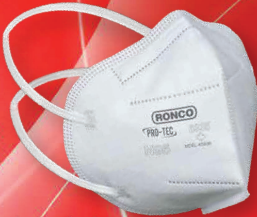
Particulate Filtering Medical and Industrial N95 Respirators, Vertical Folded