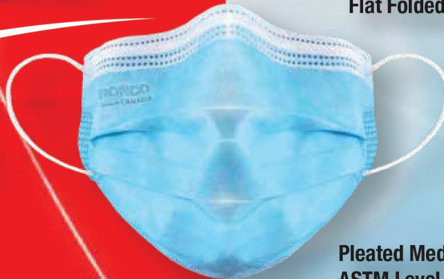
Pleated Medical Masks ASTM Level 1, 2 and 3