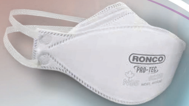
Particulate Filtering Medical and Industrial N95 Respirators, Flat Folded